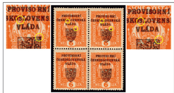
Obr. 3. Malý znak ČS. vlády (1918) – KKK (1918)

Text describing the historical context of the Prague revolutionary press in 1918, mentioning the transition from the Austro-Hungarian Empire to the newly formed Czechoslovak Republic.