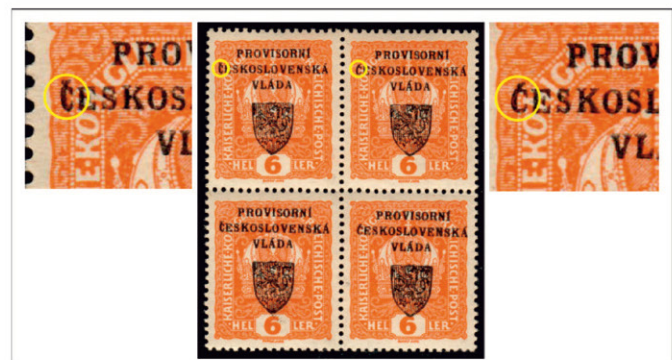
Obr. 4. Malý znak ČS. vlády (1918) – KKK (1918)

Text describing the historical context of the Prague revolutionary press in 1918, mentioning the transition from the Austro-Hungarian Empire to the newly formed Czechoslovak Republic.